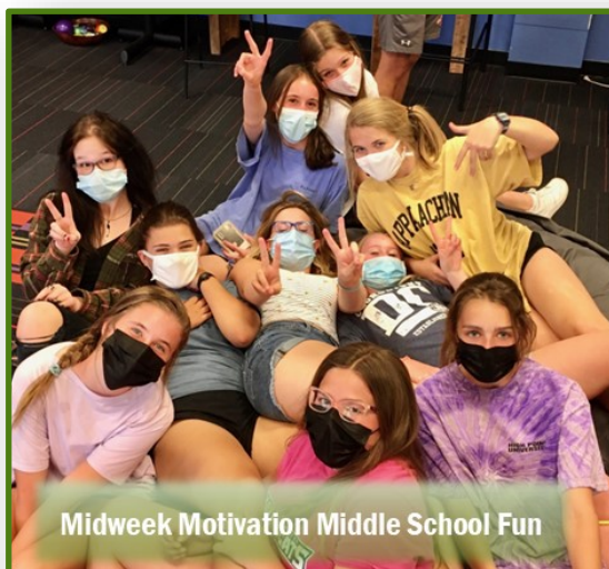
Midweek Motivation Middle School Fun