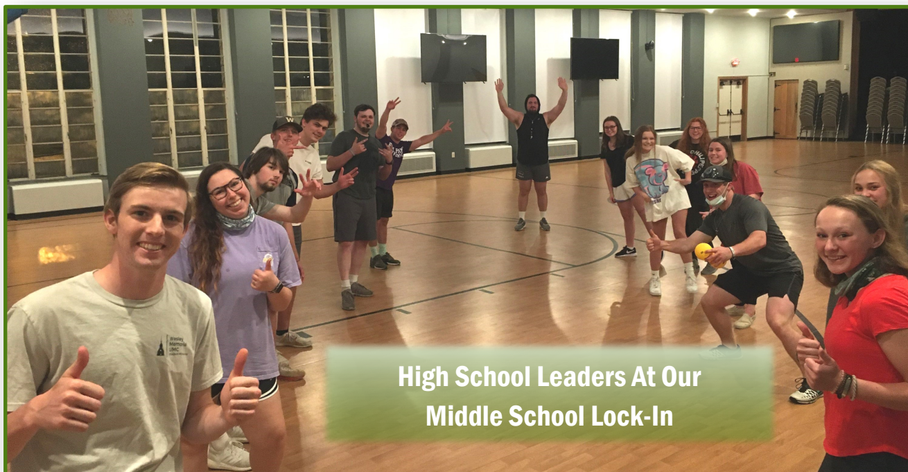
High School Leaders At Our Middle School Lock-In