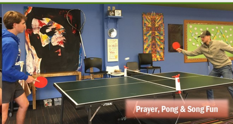
Prayer, Pong & Song Fun