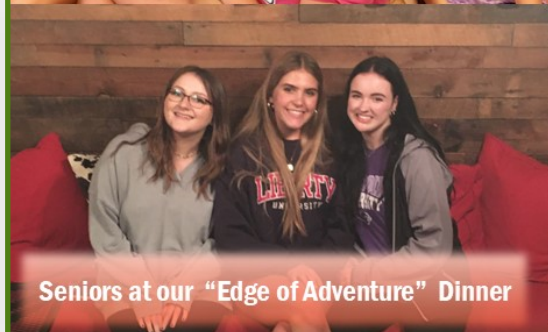
Seniors at our "Edge of Adventure" Dinner