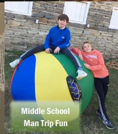
Middle School Man Trip Fun