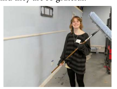
Commander Peace Academy